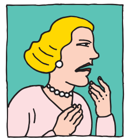
Upset or nervous