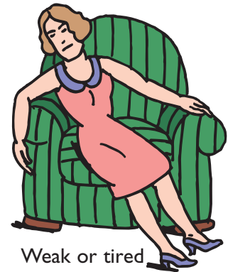
Weak or tired