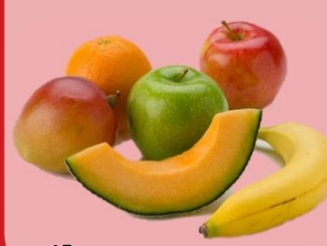
15 g carbohydrate per serving